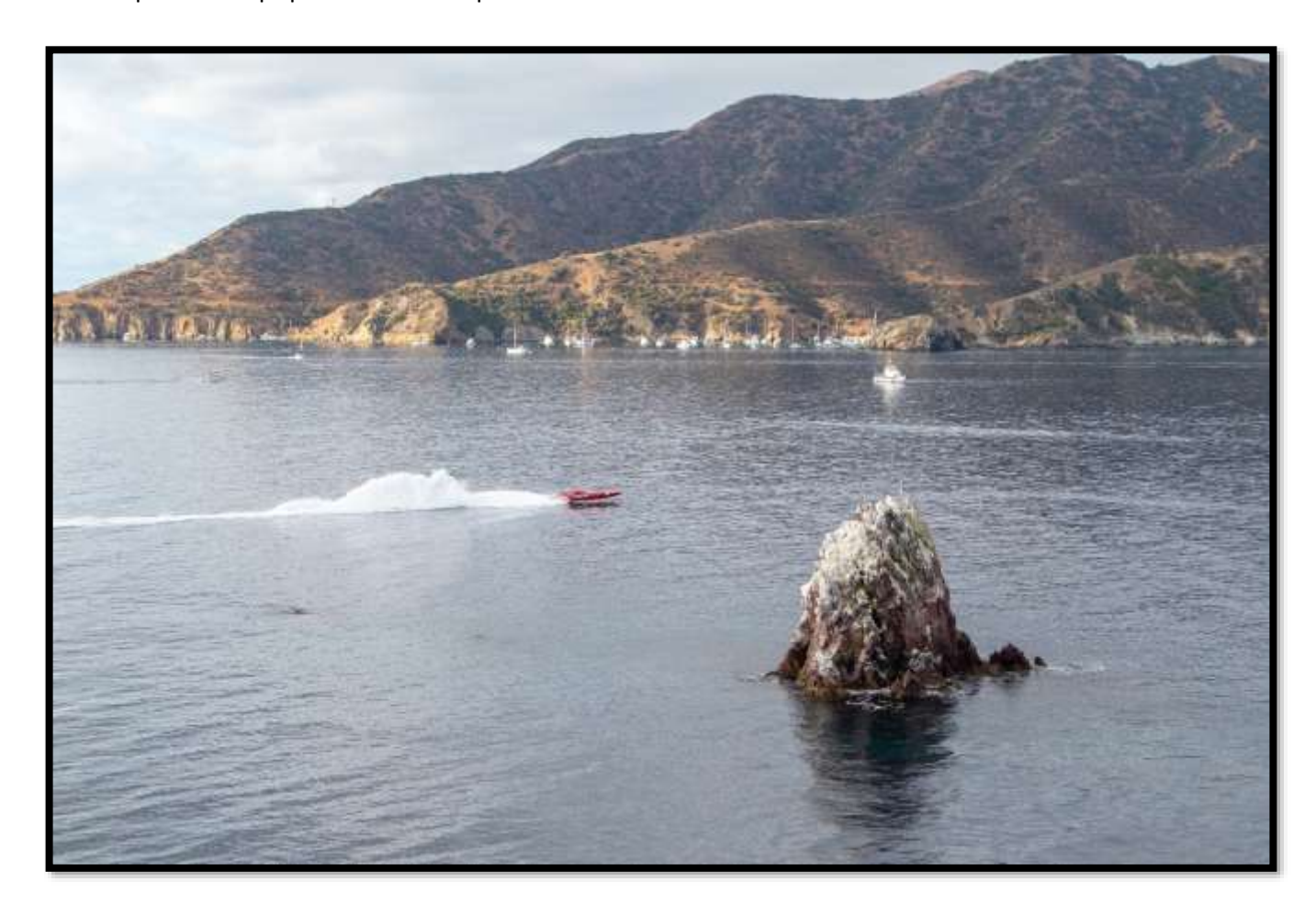
In 2021, Nigel and Jay Johnson in their new 52' Mystic CAT re-established their World Record – Ocean Cup - The Rum Run – Huntington Beach around Catalina in 1hr 0min 10sec with average speed of 112.5mph and a top speed of 145mph.

Ocean Cup - The Rum Run – Huntington Beach around Catalina in 1hr 19min 28sec with average speed of 84.941mph and a top speed of 129.23mph.